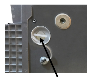
Drain cap and rubber drain plug

To disconnect the inlet hose from the portable unit, push the water inlet button while pulling the inlet hose at the same time.